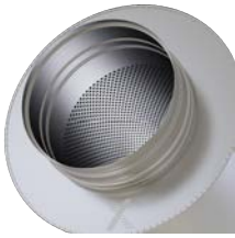
Spigot with groove