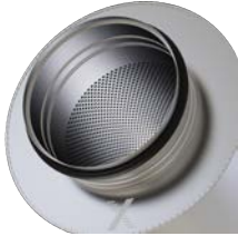
Spigot with lip seal