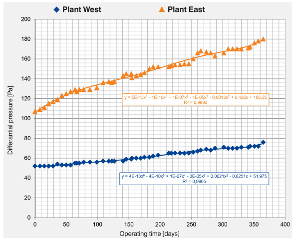
Fig. 1: Graph showing all recorded measurement data

It was now necessary to determine how much energy had been required by each system to overcome the differential pressure – or, to put it differently, to pass air through the filters. Using a formula which interrelates volume flow rate, operating time and fan efficiency, it is possible to calculate the energy requirement for every cubic metre of air moved. The result: over the running time, the NanoWave® pocket filter required around 0.3 kWh/a for each m 3 /h of operating volume flow rate. The synthetic filter consumed 0.71 kWh/a. This means that the TROX NanoWave® filter is around 58% more efficient.