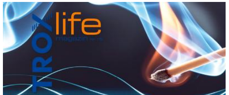
NO 15: SOUND AND SMOKE. CONTROLLING THE SPREAD OF NOISE AND SMOKE.