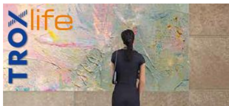
NO 12: ARTS AND CULTURE. ARTFUL AIR DESIGN