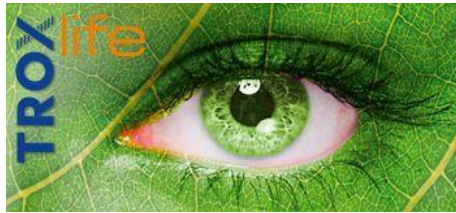
NO 19: SUSTAINABILITY. SUSTAINABILITY IS THE FUTURE.