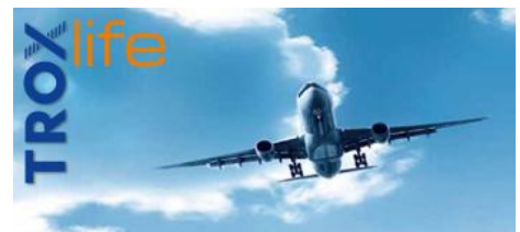
AIRPORT AIR. THE ART OF HANDLING AIRPORT