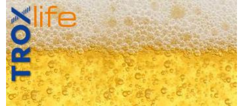
NO. 11: FOOD AND DRINK. AIR PURITY IN BREWERIES.