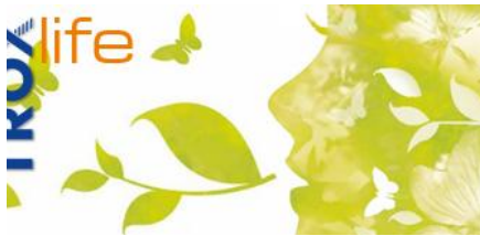
AIR AND LIFE. INDOOR LIFE QUALITY.