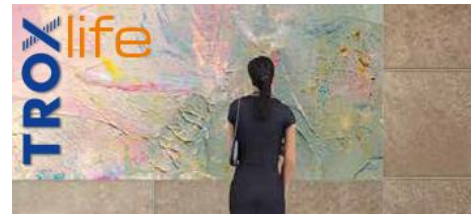
ARTS AND CULTURE. ARTFUL AIR DESIGN