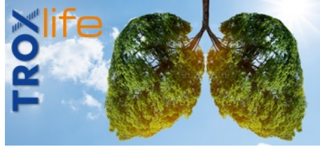
AIR + HEALTH. AIR IS LIFE.