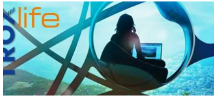
COUNTRY AIR, CITY AIR. URBANISATION AND THE CONSEQUENCES.