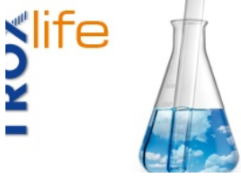
IR + PHARMACEUTICALS ENTILATION CONCEPTS IN THE PHARMACEUTICAL INDUSTRY.