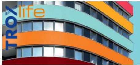
ARCHITECTURE AND DESIGN. THE ART OF DESIGNING AIR.