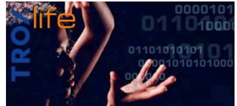
ONES AND ZEROS. DIGITAL TRANSFORMATION.