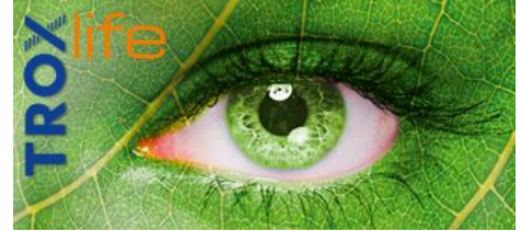
SUSTAINABILITY. SUSTAINABILITY IS THE FUTURE.