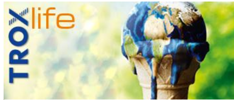
CLIMATE AND CHANGE. NEW CHALLENGES FOR THE HVA INDUSTRY.