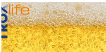
FOOD AND DRINK. AIR PURITY IN BREWERIES.