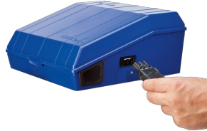
CONNECTION SOCKET FOR LIGHTING