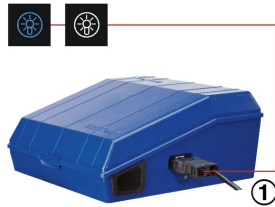
BUTTONS ON THE CONTROL PANEL TO SWITCH THE LIGHTING ON/OFF