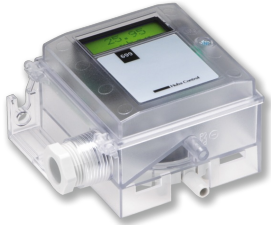
DIFFERENTIAL PRESSURE TRANSDUCER 699